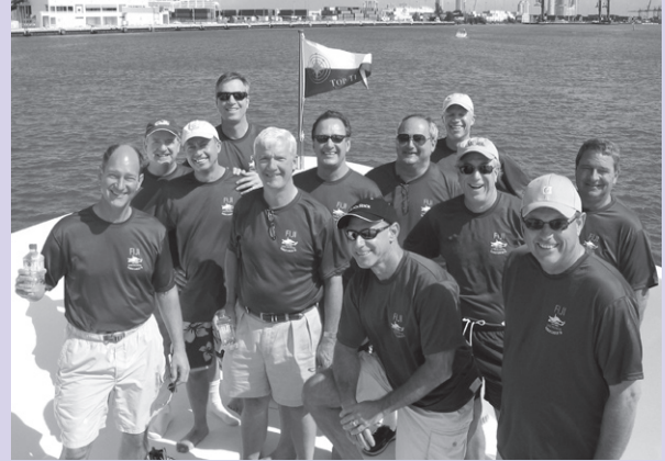
The Class of 1974 Lambda Iota at its annual reunion, this year the brothers gathered in Ft. Lauderdale.